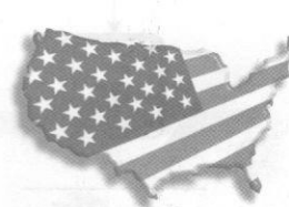
the United States