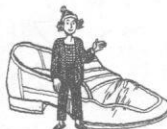
in front of